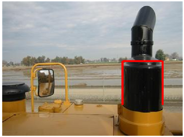
Figure 1: Retrofit reduces masking caused by muffler OEM muffler outlined in red.